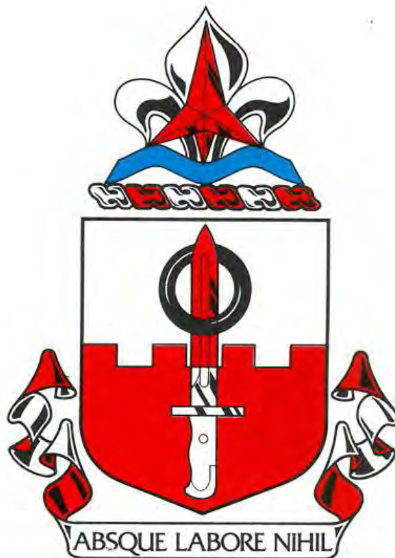
125th Armored Engineer Battalion